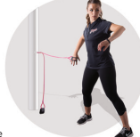
Exercise 11 Step 1