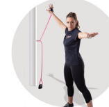
Exercise 12 Step 1