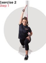
Exercise 2 Step 1