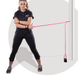
Exercise 7 Step 1