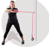
Exercise 9 Step 1