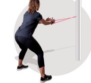
Exercise 5 Step 1