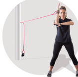
Exercise 8a Step 1