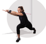
Exercise 3 Step 1