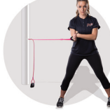
Exercise 6 Step 1