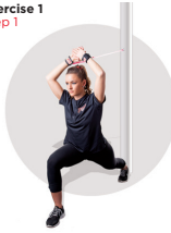
Exercise 1 Step 1