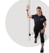
Exercise 8b Step 1