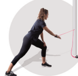
Exercise 10 Step 1