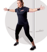
Exercise 4 Step 1