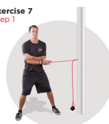
Exercise 7 Step 1