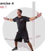
Exercise 4 Step 1