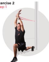
Exercise 2 Step 1