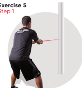
Exercise 5 Step 1