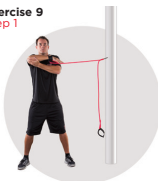
Exercise 9 Step 1