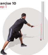
Exercise 10 Step 1