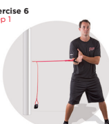
Exercise 6 Step 1