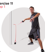
Exercise 11 Step 1