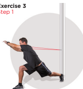
Exercise 3 Step 1